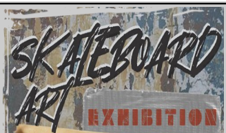
Exhibit & Silent Auction for